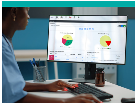
PROVIDER STAFF DASHBOARD

Connected Care is a fully integrated suite of diagnostic devices, software integration, remote patient monitoring, and logistics management for patients and providers.